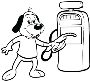
HONEST SCALES & GAS PUMPS